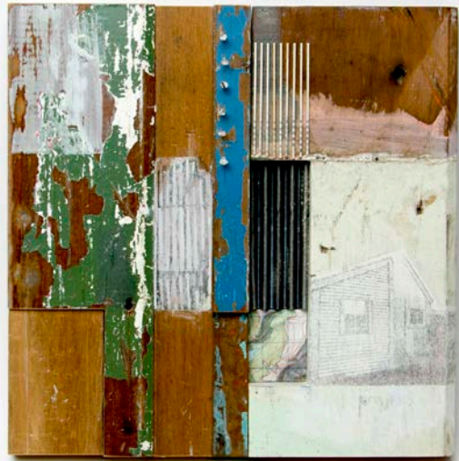
T Sweet, Tectonic Displacement Collage 2, 2014