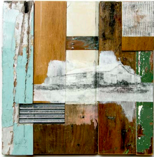
T Sweet, Tectonic Displacement Collage 1, 2014

The materials applied to the construction of the final body of work will include a juxtaposition of 'waste' material salvaged from homes within each of the three regions/cultural centres explored. The images below reference a primary material aesthetic that will be utilised in the development of this project. ( Printmaking/woodcut will be produced directly on these materials as well as on paper. )